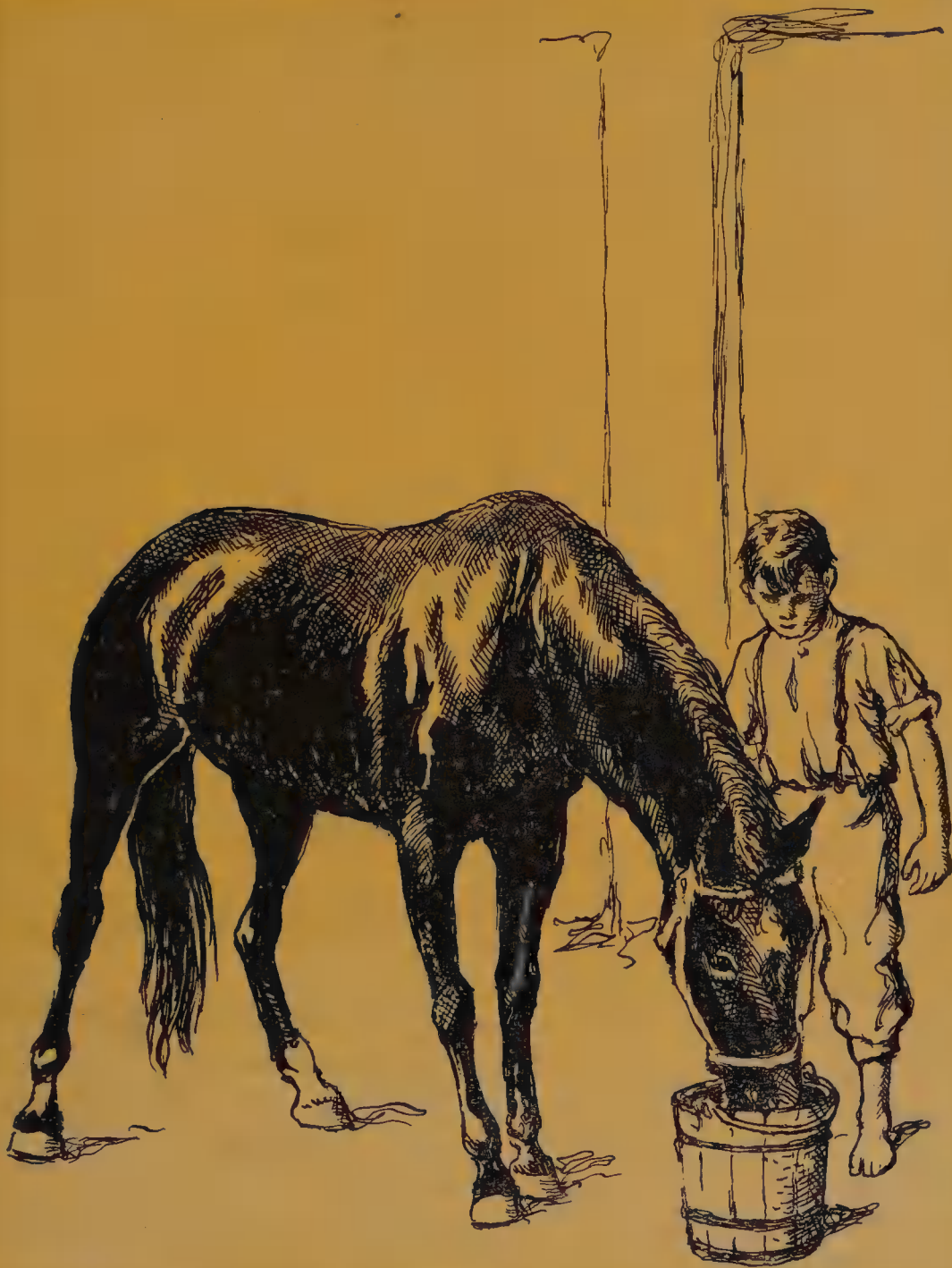
He gave me a pail full of water to drink